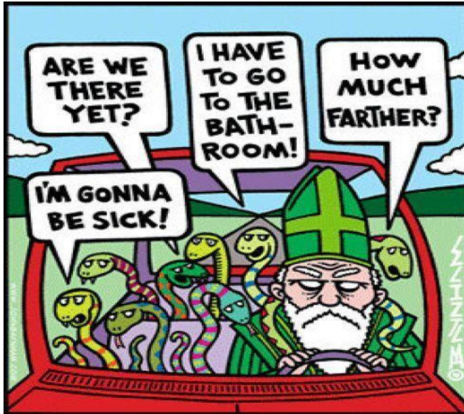
St. Patrick driving the snakes out of Ireland.